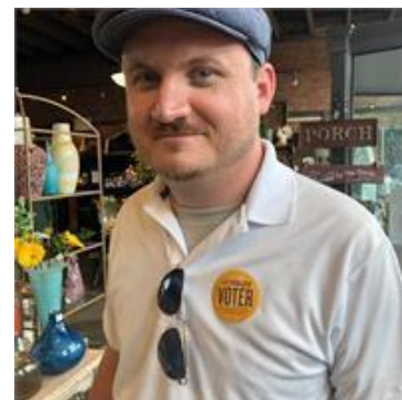
Ford Simmons NCURA App