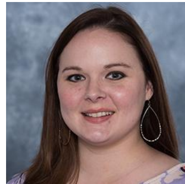
Molly Sagona Hospitality