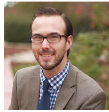
Trey Bauer Audio Visual